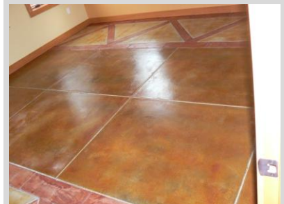
Malay Tan stain was applied to the main floor area. The border is a combination of Golden Wheat and Cola stain.